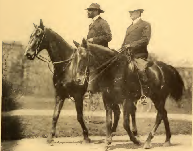
JOSEPH PULITZER IN 1902, RIDING IN CENTRAL PARK WITH A SECRETARY